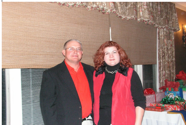
Top Left: New Officers & Board of Directors